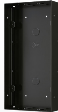
IXG-DM7-BOX Flush-Mount Back Box

Configure locally or remotely at aiphone.cloud