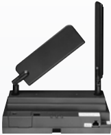
IXGW-TGW Cloud Gateway with 4G LTE