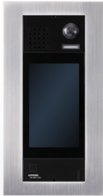
IXG-DM7-HIDA 7" Touchscreen Video Entrance Station