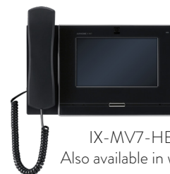
IX-MV7-HB Also available in white