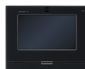
IX-MV7-B Also available in white